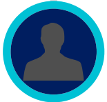
DIRECTOR CAPITAL PROJECTS